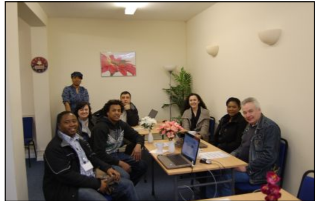
All are welcome

Inside: An IT Volunteer shares what it means to him to work in the Internet Community Café, see page 5