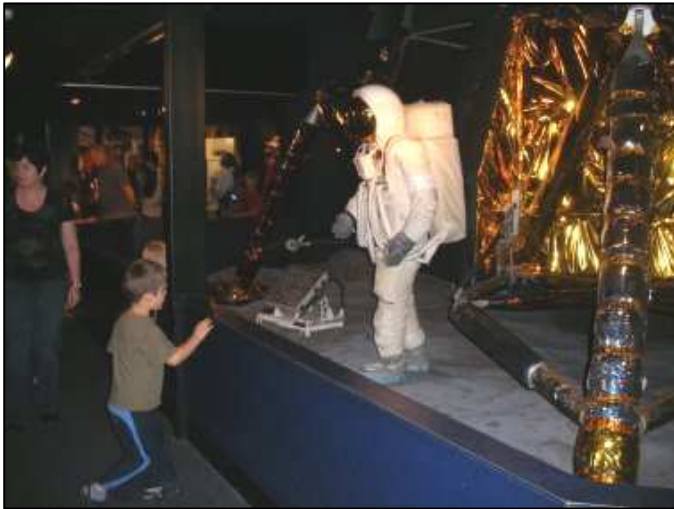
The Science Museum in London

It has been an amazing time in the last 5 weeks filled with lots of activities and events for children and parents at Sure Start Centre, Staple Tye.